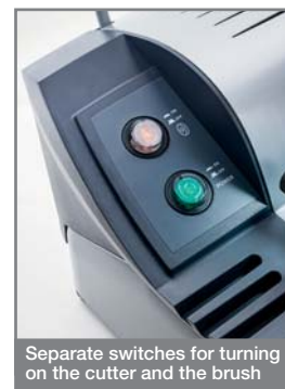
Separate switches for turning on the cutter and the brush

The on-off switch features a safety cut-out for user protection. The machine needs to be manually re-started after a power interruption. The carriage cannot be released until the gauges have been disengaged for avoiding accidental damage.