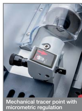
Mechanical tracer point with micrometric regulation

The carriage is released by pressing the red button between the clamps, which automatically activates the cutter for practical and safe key cutting operations. The ergonomic levers and knobs and the neon lamp in optimized position above the key cutting area ensure the work station is comfortable and well illuminated.