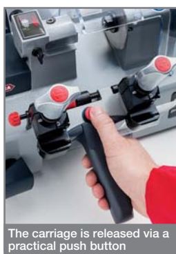
The carriage is released via a practical push button

The machine is equipped with a mechanical tracer point with micrometric adjustment ring nut (+/- 0,05 mm) for an accurate key cutting.